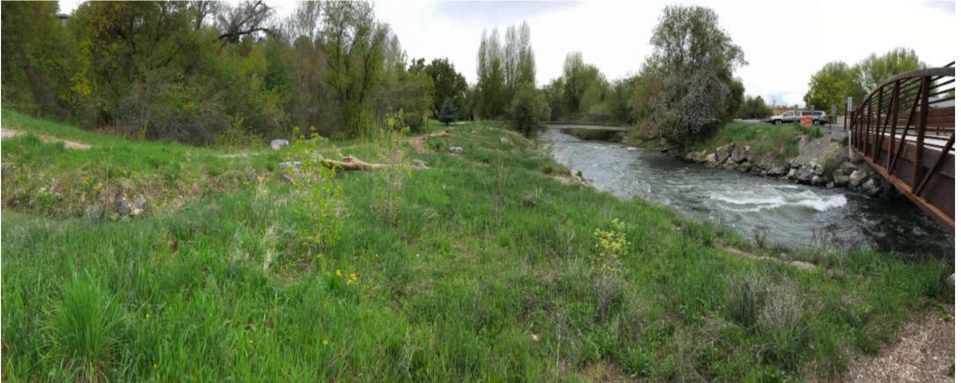
Denzil Stewart Nature Park