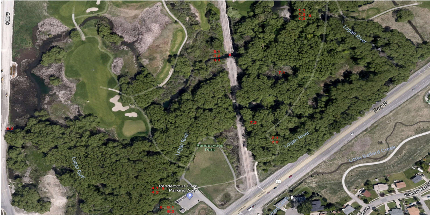
Logan River Restoration Project