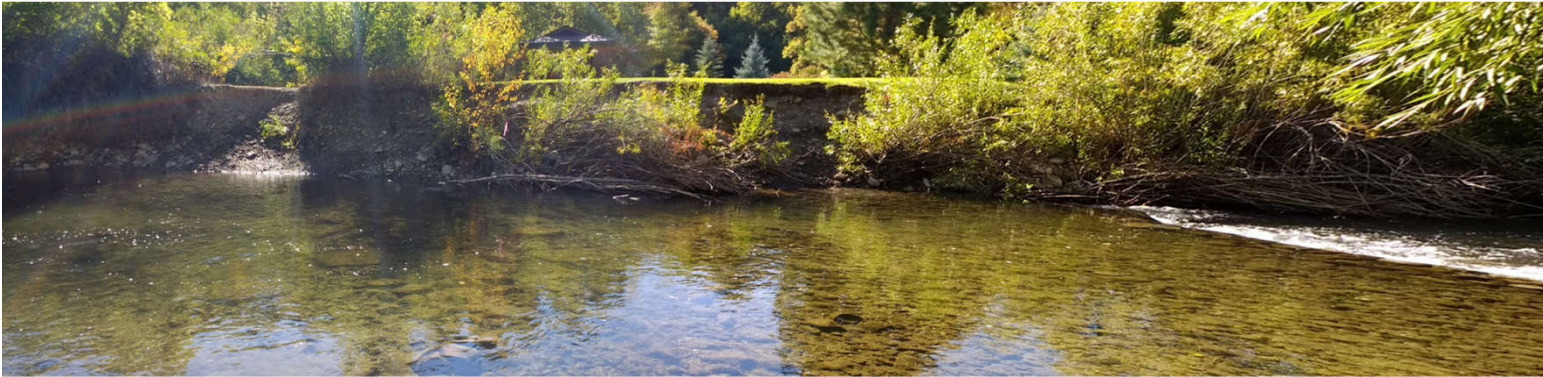
Photo PT 2.1 Summer 2016 Looking at River Left Eroding/Repaired Bank

Just Upstream of large stump on river right (North Side) of Logan River.